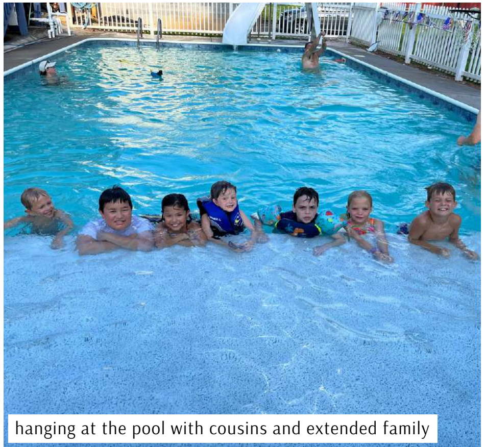
hanging at the pool with cousins and extended family