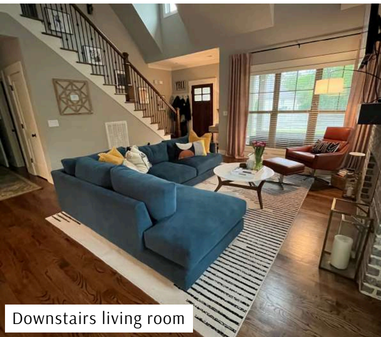
Downstairs living room

There's a community park just 5 minutes away with a playground. We live 10 minutes away from a beautiful 130 acre nature preserve.