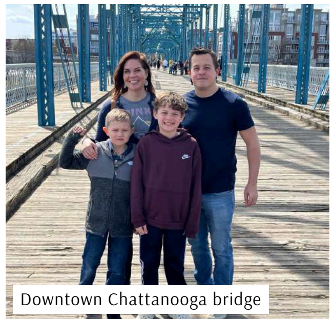
Downtown Chattanooga bridge