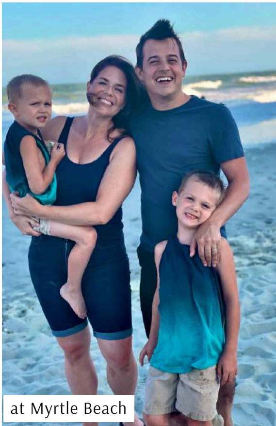
at Myrtle Beach