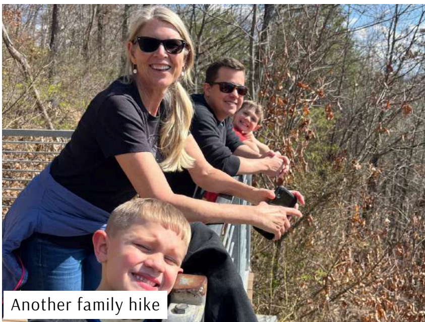
Another family hike