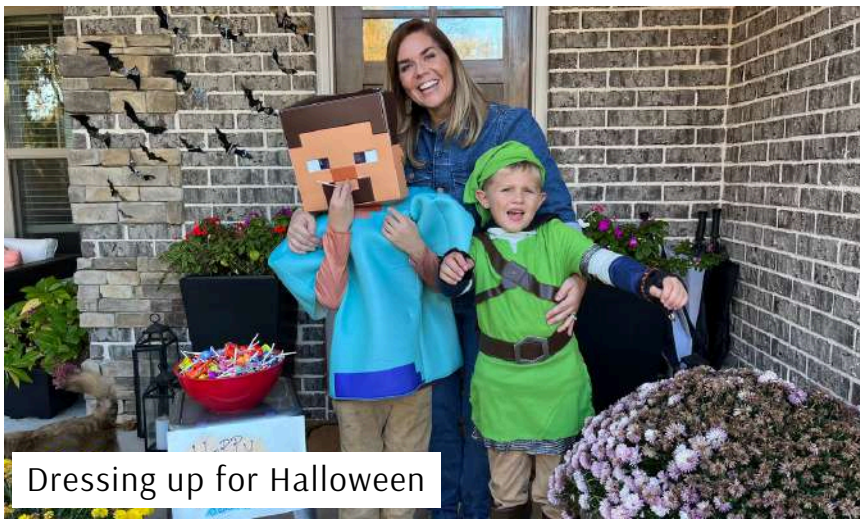
Dressing up for Halloween