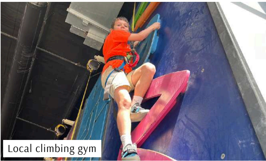
Local climbing gym