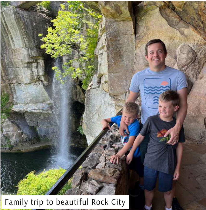
Family trip to beautiful Rock City