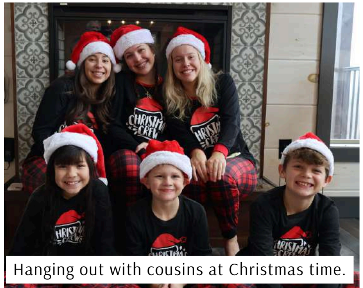
Hanging out with cousins at Christmas time.