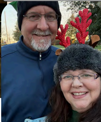
Papa and Mimi