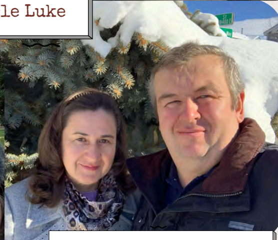
Babushka and Dedushka